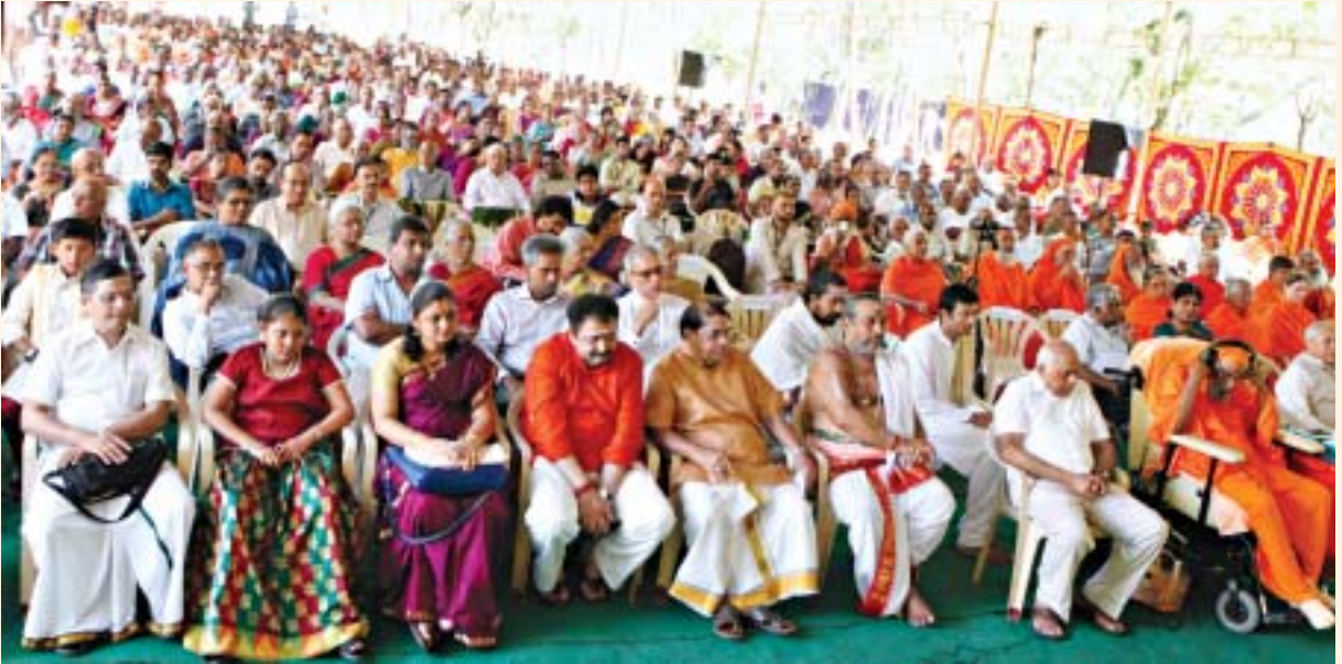
Section of audience at Annual Function