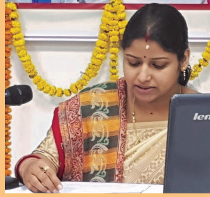
Theory of Vedic Interpretation Wrt Siddhānjana of TV Kapāli Shāstry - by Dr.Kabitā