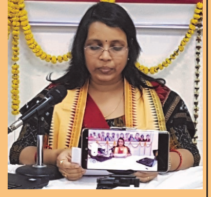
A Preliminary study of Purānas - by Sanghamitra Mohanty