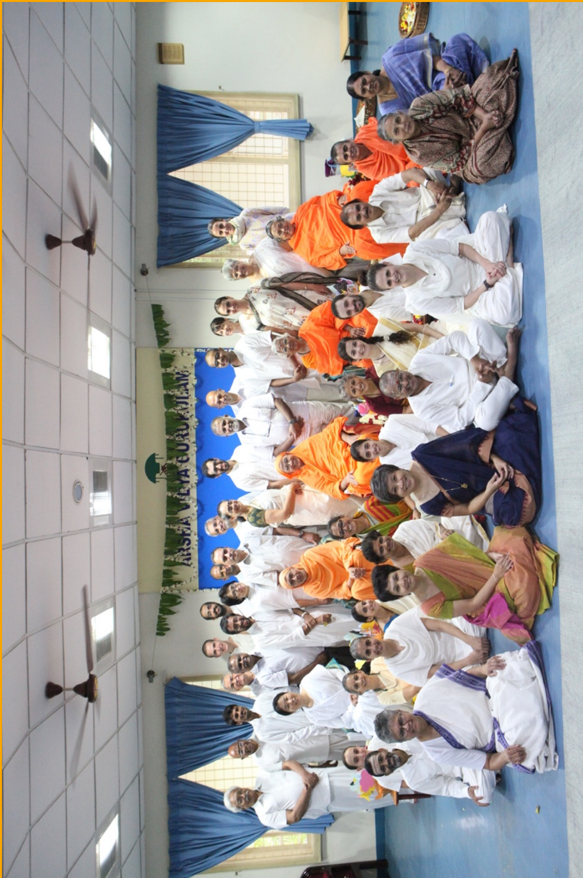
Course Students with Acaryas on Gurupurnima Day