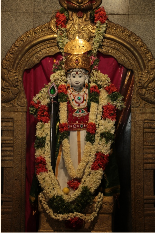
Sri Bala Dhandayudhapani, Tapasimalai

At Arsha Vidya Study Centre ashram at Tapasimalai, Pudukottai