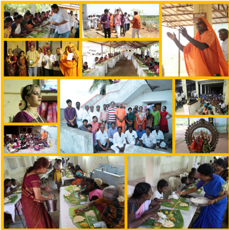
Annadanam and other activities

Mobile: 9790113729, 9489179039 | Email: 99happymind@gmail.com |