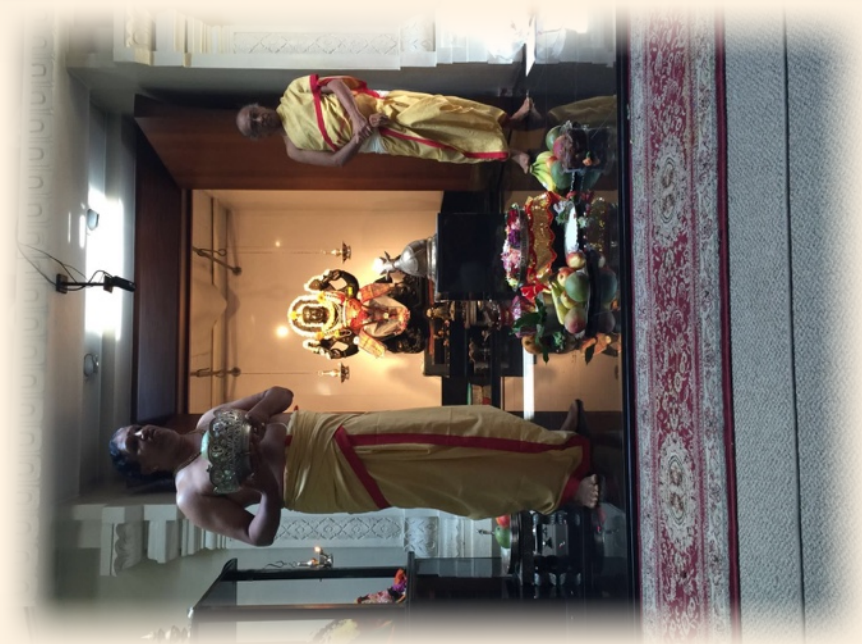
Saylorsburg, PA, USA