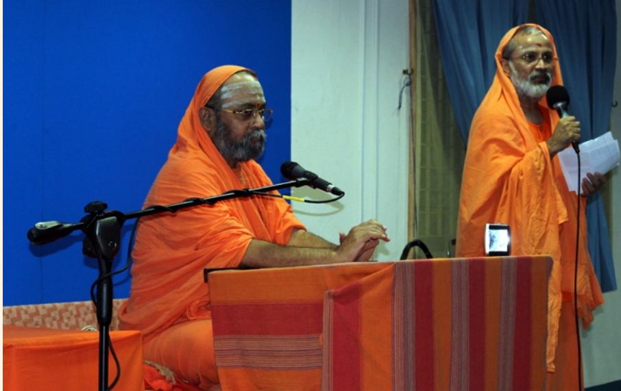
Acarya introducing Swamiji

A: Sastra prescribes that. We follow that implicitly. According to Advaita, all samskara relate to mind only. One should learn about four goals of life during first 25 years. From 25 years to 60 years one can earn money and enjoy pleasures as permitted by dharma Sastra. From 60 years to 75 years one can take retirement and be in vanaprastha. After 75 years one can live like a sannyasi.