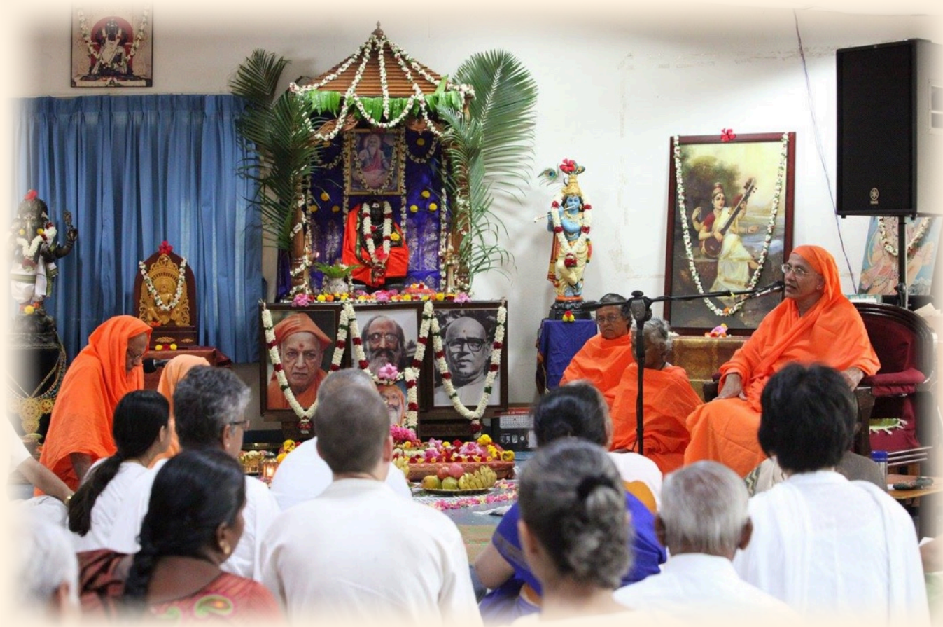
AnugrahaBhashanam by Swamiji

A Guru is one who is the teacher of the maha vakya, the equation revealing that you are the whole. The Guru, the person with a human body, who teaches, becomes an altar of worship. Guru Purnima is a very important day for spiritual seekers. On this day we seek the blessings of all Gurus in the tradition starting from the first Guru Lord Dakshinamurthy.