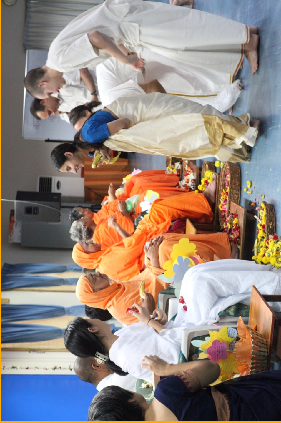
Acarya Vandanam on Gurupurnima Day