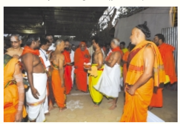
Pujya Swamiji arriving at the Yagnasala