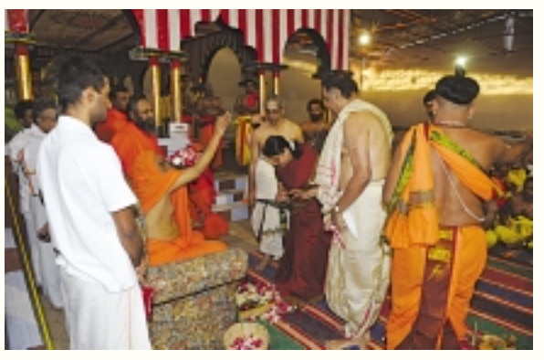
Blessing devotees at the yagnasala