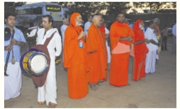
Melavadhya group awaiting Pujya Swamiji