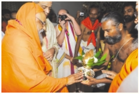
Purnakumbham to Pujya Swamiji