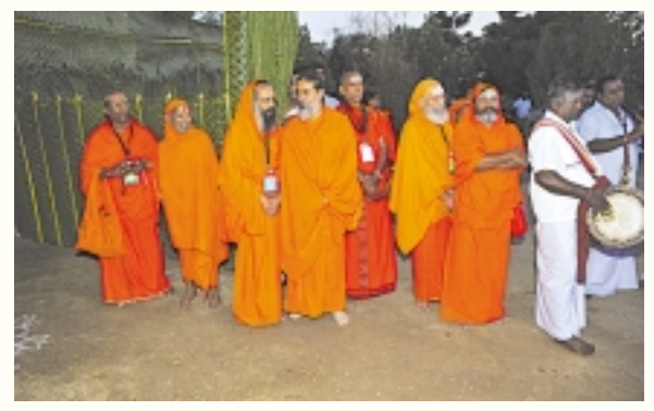
Disciples waiting for Pujya Swamiji