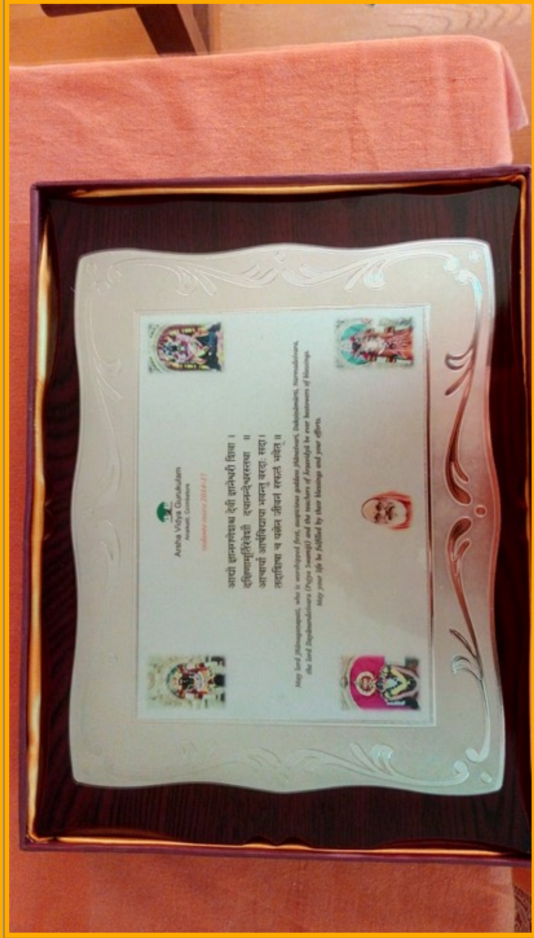
Long Term Course memento