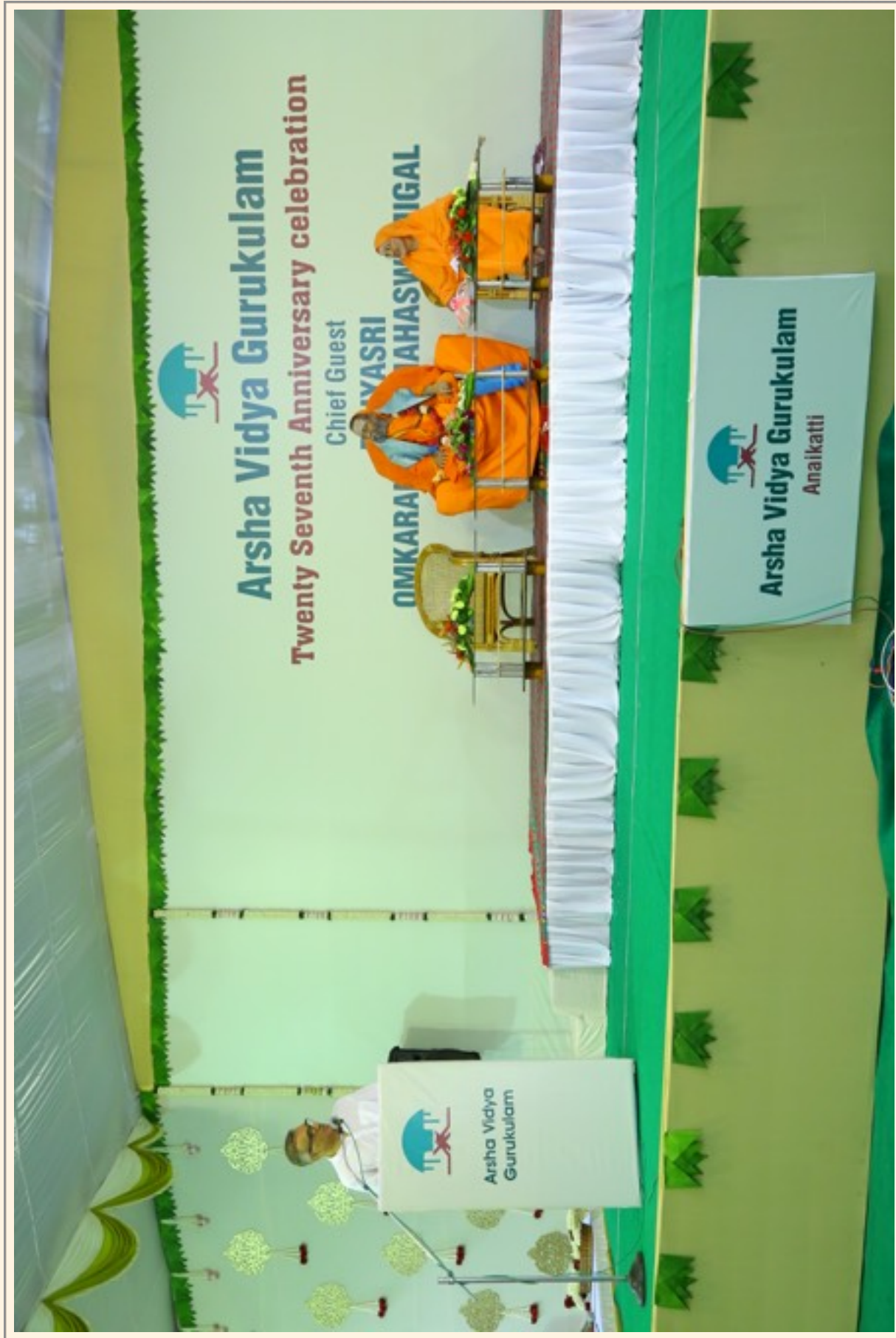
AVG Annual Day