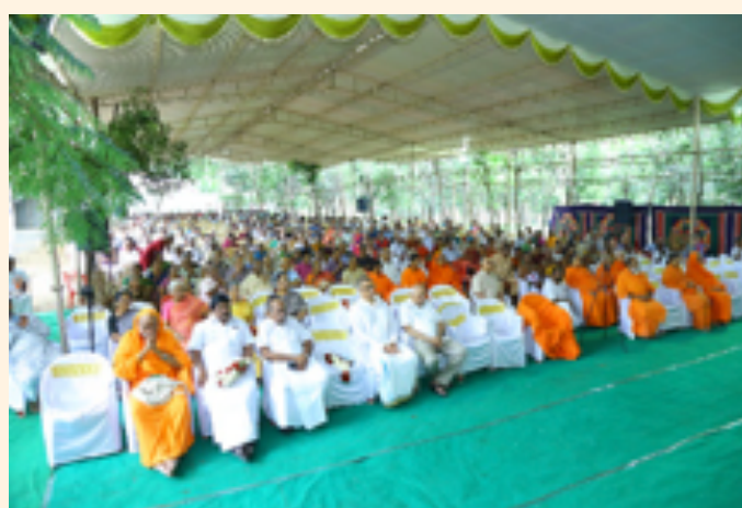
Section of Audience