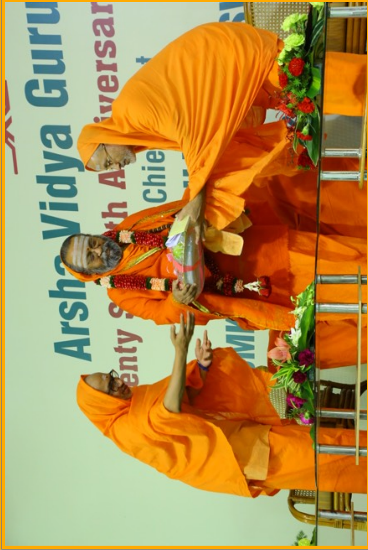
AVG Annual Day Swami Omkaranandaji honoured by Acaryas