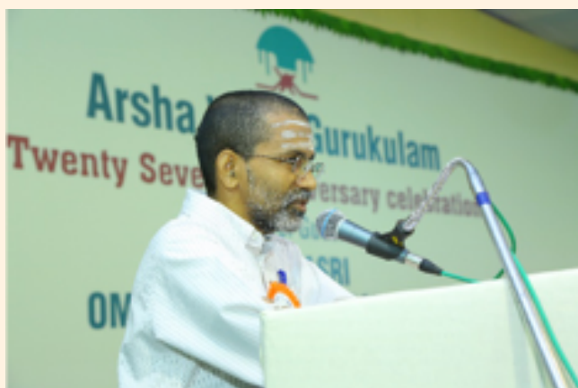
Master of Ceremony