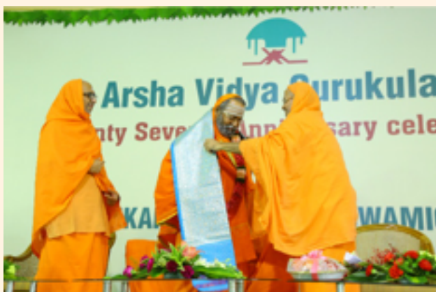
Honouring of Chief Guest

At this point of time it becomes our bounden duty to revive temples and cultural education to its pristine glory so that the Sanatana Dharma is passed on to next generation.