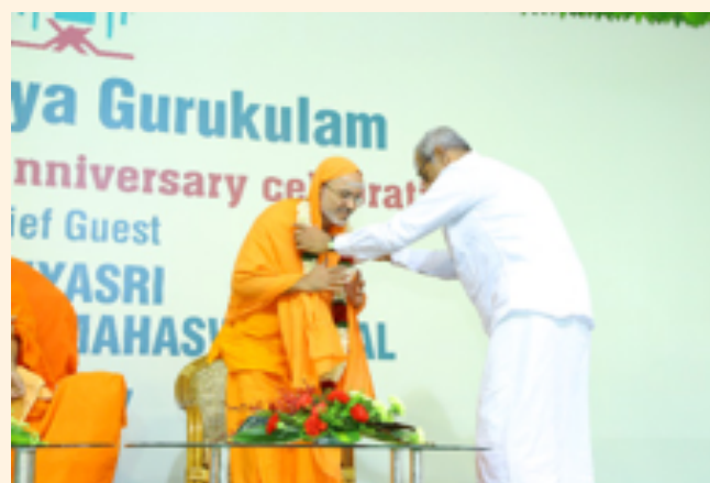
Honouring of Acarya