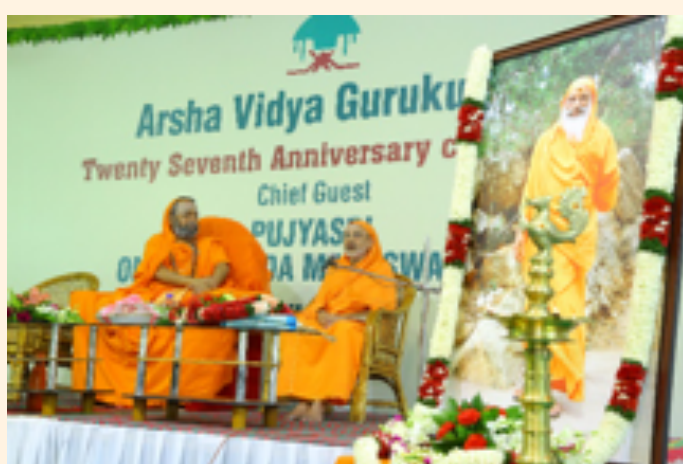
Anugraha Bhashanam by Acarya