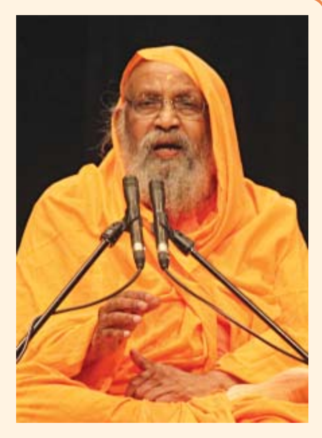
words, it makes you discover you are Brahman.'

struggling, seeking, being cheated and dissatisfied. Knowing the Self, you are the very meaning of satisfaction. Satisfaction is centred on you. You are the meaning of satisfaction. Upanishad, this life of becoming it puts and end to, in other