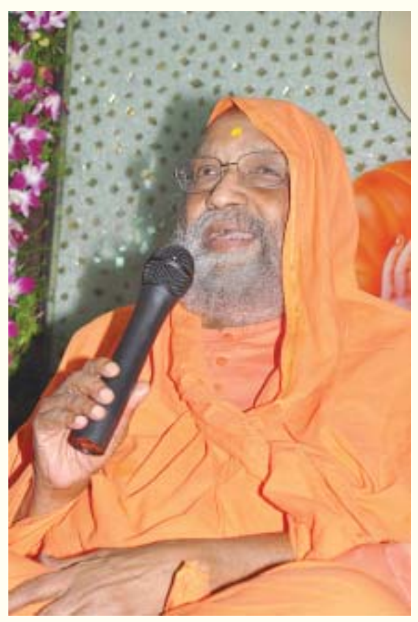
There is nothing equal to that. Ānyaḥ na vidhyate yasya. There is nothing like that.