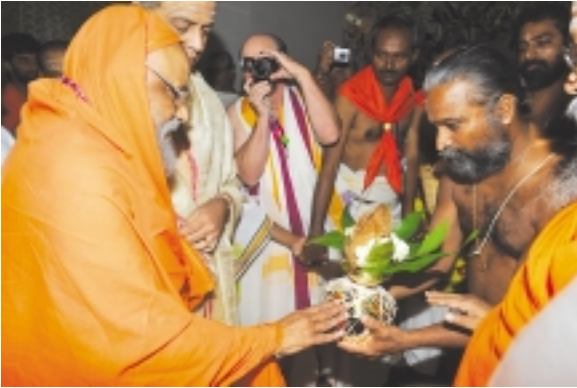
Purnakumbham to Pujya Swamiji