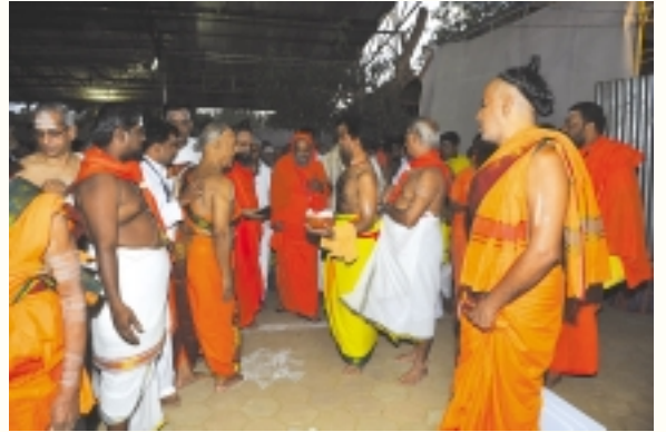
Pujya Swamiji arriving at the Yagnasala