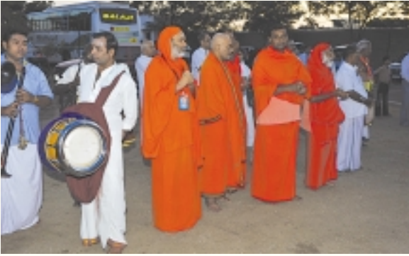
Melavadhya group awaiting Pujya Swamiji