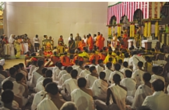
Pujya Swamiji at the yagnasala