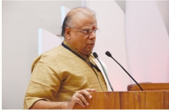
Prayer song by Maharajapuram Ramachandran