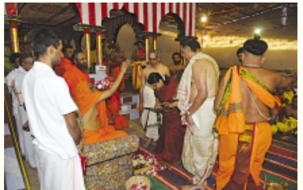
Blessing devotees at the yagnasala