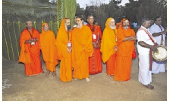
Disciples waiting for Pujya Swamiji