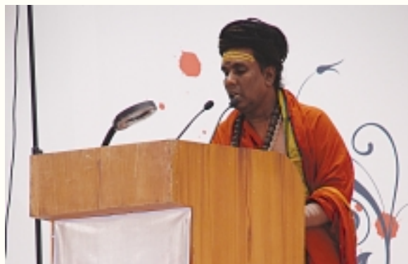
Address by Sri Sivalingeswara Swamigal