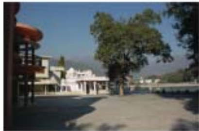
Dayananda Ashram is on the banks of Ganga in Purani Jhadi area of Rishikesh.