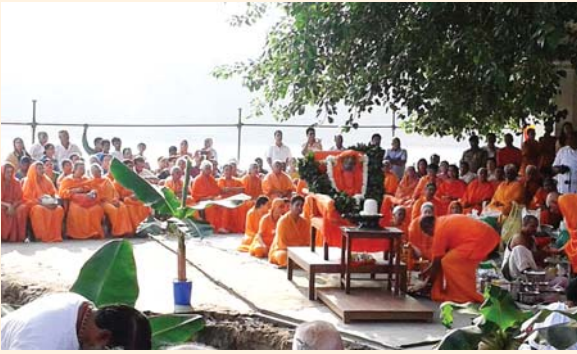
Bhu samadhi ceremony