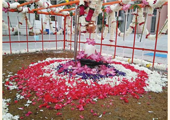
Siva linga at adhishtanam