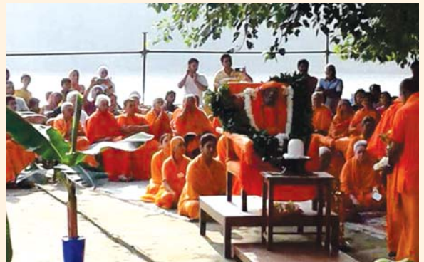
Shodasa Upacara Pooja 2