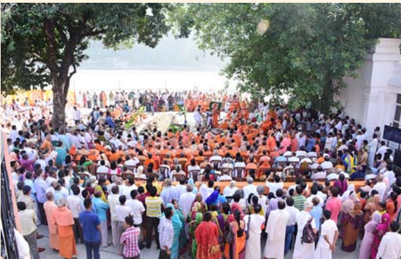
Maha-samadhi with Ganges at back-ground