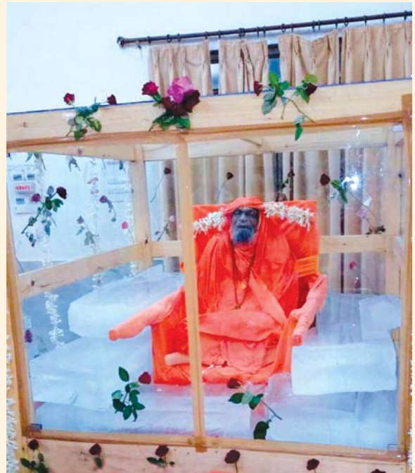
In Meditative Posture

FINAL RITUALS : On September 25, 2015 around 8 a.m., Pujya Swamiji's sacred body was taken from the lecture hall in a procession with ringing of bell, blowing of conch and holy chants to a place between