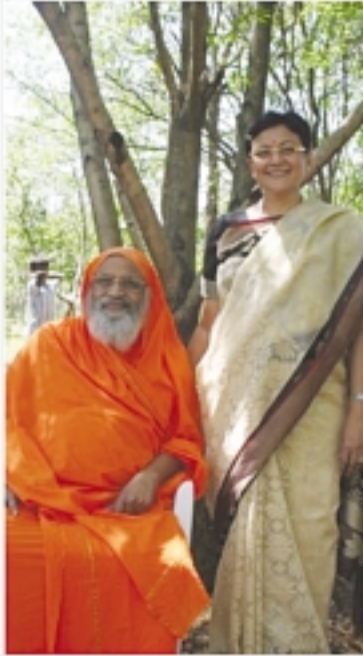
The author with Pujya Sri Swami Dayananda Saraswati